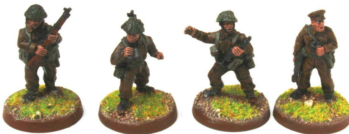
Crusader figures painted by Mick Farnworth

Artizan and Crusader figures are fully compatible and can be mixed in the same unit. Figures may be selected from both ranges can be used for the major campaigns.